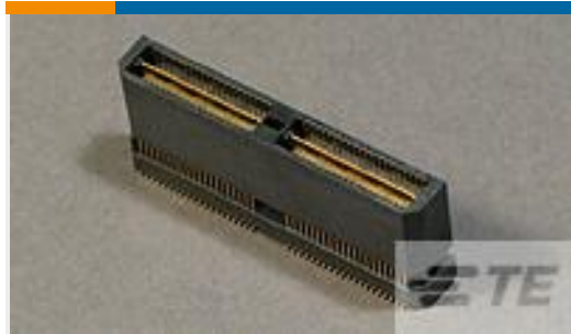
TE Part # 5-1658466-2 MSB0.80PL16ASY56DP,GP,30,VCTR