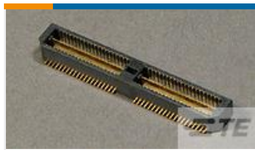
TE Part # 5-1658463-2 MSB0.80PL5ASY56DP,GP,30,VCTR