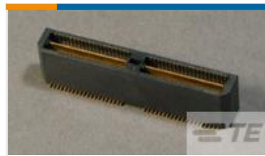
TE Part # 5-1658465-2 MSB0.80PL11ASY56DP,GP,30,VCTR