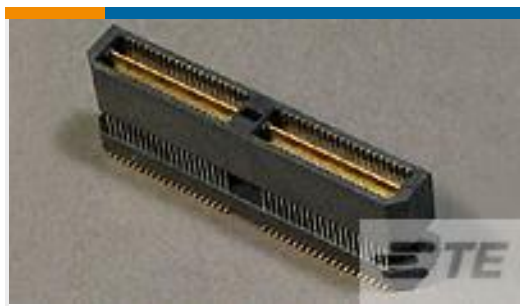
TE Part # 5-1658439-2 MSB0.80PL14ASY56DP,GP,30,VCTR